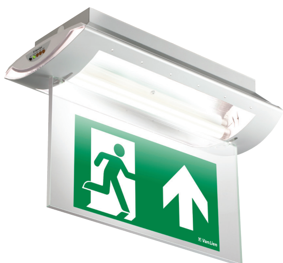
OL(N) + PPL 315/51/BL