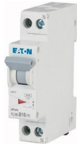
Miniature Circuit Breaker: PLN6 Series (MW)