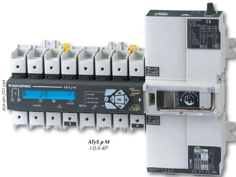
ATyS p M I-O-II 4P