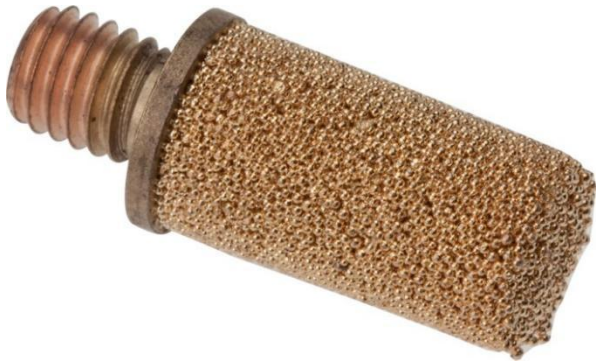
M5 and M7

Sintered Bronze Pneumatic Mufflers With Screw Slot