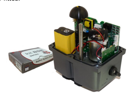
BSR Failsafe plug & play kit can be added to create failsafe modulating function.

The BSR failsafe system comprises of an industrial rechargeable NiCad battery and a PCB containing a trickle charger and control circuitry. It can either be installed by J+J on original supply, or retro-fitted.