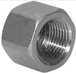
End caps with female NPT thread, up to 16 bar