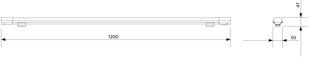
LED T8 Batten 1200mm