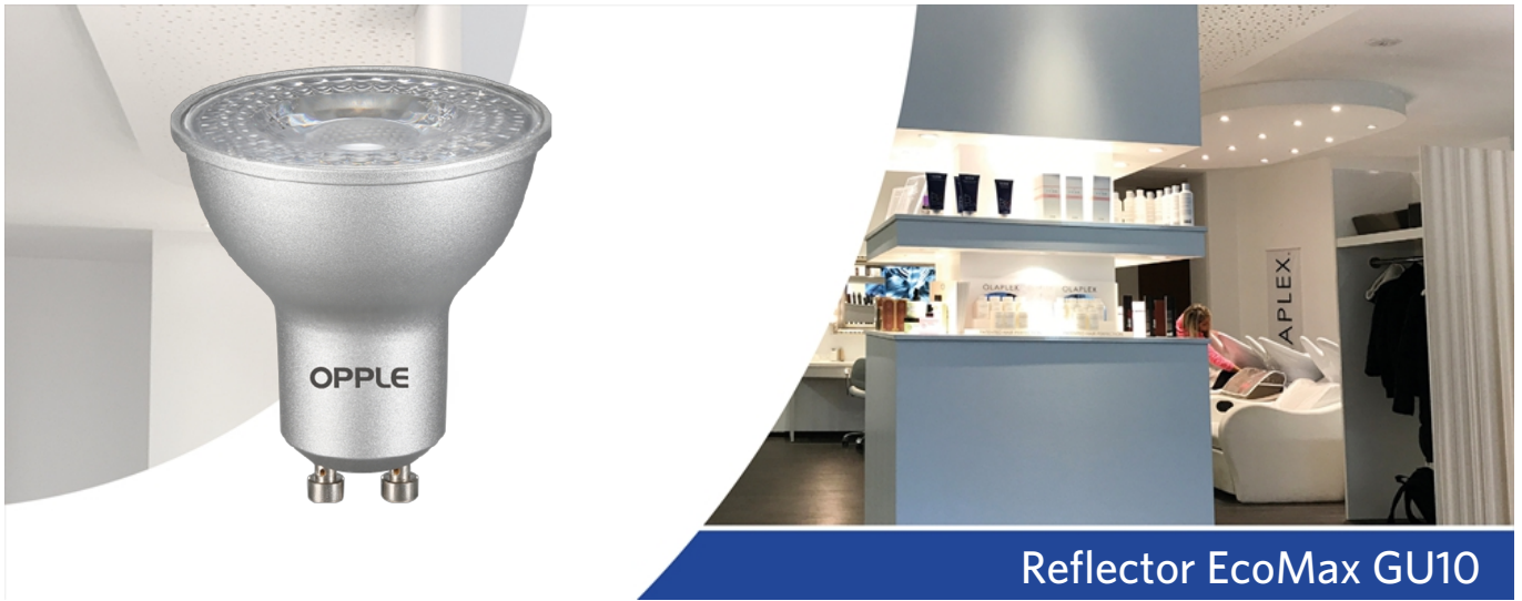
Reflector EcoMax GU10