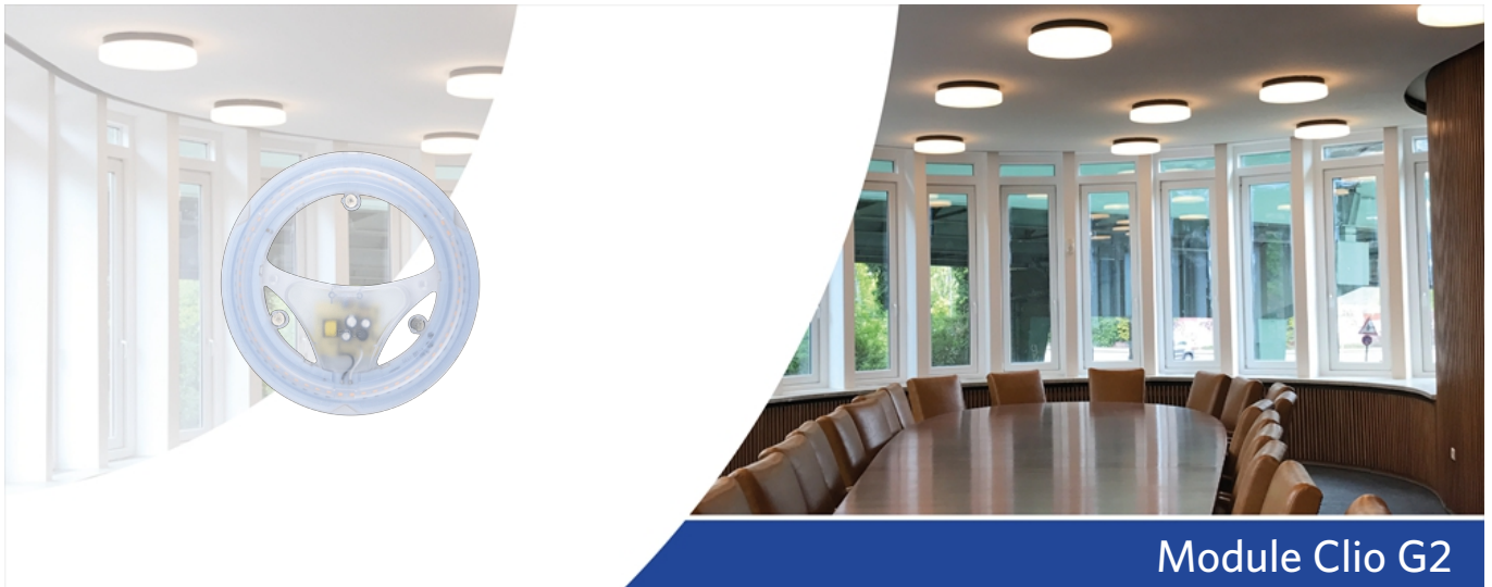
Module Clio G2