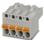
PCB connector, nominal cross section: 2.5 mm 2 , color: light gray, nominal current: 12 A, rated voltage (III/2): 320 V, contact surface: Tin, type of contact: Female connector, number of potentials: 3, Number of rows: 1, Number of positions per row: 3, number of connections: 3, product range: FKCT 2,5/..-ST, pitch: 5 mm, connection method: Push-in spring connection, conductor/PCB connection direction: 0 °, Locking clip: - Locking clip, plug-in system: CLASSIC COMBICON, Locking: without, mounting: without, type of packaging: packed in cardboard

Printed-circuit board connector - FKCT 2,5/ 3-ST KMGY - 1998263