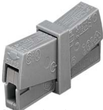
Packing unit 50 pieces

Item no.: 224-201 Product description: SERVICE CONNECTOR; CAGE CLAMP®CONNECTION