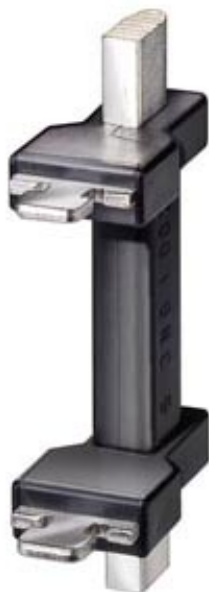
LV HRC ISOLATING LINK, SIZE 00 WITH INSULATED GRIPPING LUG