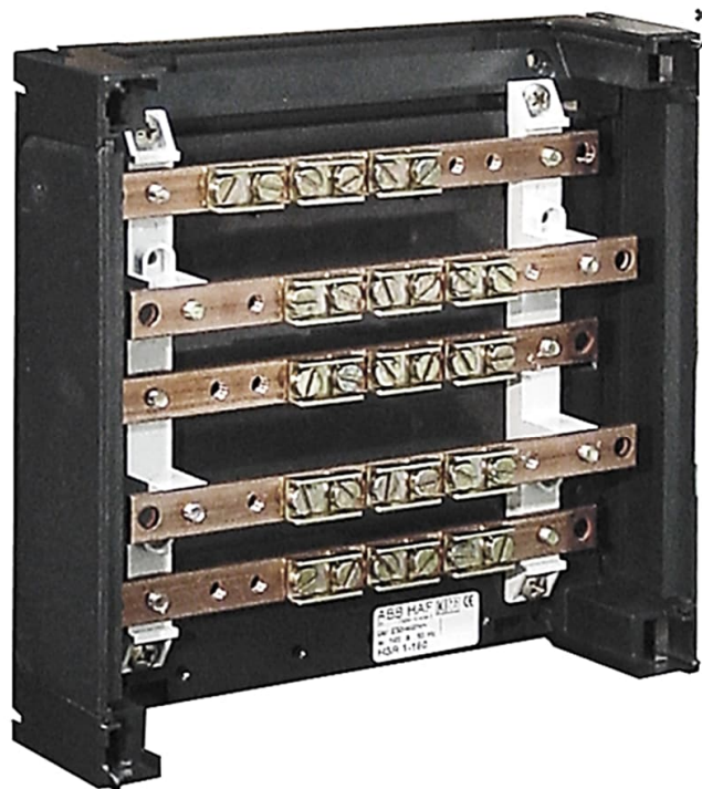
HSR1-160 - 6963.220