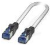
Patch cable, CAT6, pre-assembled, 1.0 m

Patch cable - FL CAT6 PATCH 1,0 - 2891385