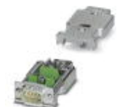
D-SUB plug, 9-pos., pin, axial design with two cable entries, universal type for all systems, pin assignment: 1, 2, 3, 4, 5, 6, 7, 8, 9 to screw connection terminal block

D-SUB bus connector - SUBCON-PLUS-M/AX 9 - 2904467