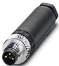
Connector, Universal, 3-position, Plug straight M8, A-coded, Screw connection, knurl material: Nickel-plated brass, external cable diameter 3.5 mm ... 5 mm

Please be informed that the data shown in this PDF Document is generated from our Online Catalog. Please find the complete data in the user's documentation. Our General Terms of Use for Downloads are valid ( http://phoenixcontact.com/download )