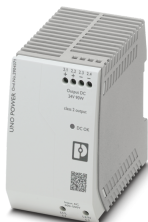
Primary-switched UNO POWER power supply for DIN rail mounting, input: 2-phase, output: 24 V DC/90 W

Please be informed that the data shown in this PDF Document is generated from our Online Catalog. Please find the complete data in the user's documentation. Our General Terms of Use for Downloads are valid ( http://phoenixcontact.com/download )