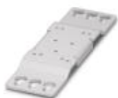
Universal wall adapter for securely mounting the power supply in the event of strong vibrations. The power supply is screwed directly onto the mounting surface. The universal wall adapter is attached at the top/bottom.

Assembly adapters - UWA 182/52 - 2938235